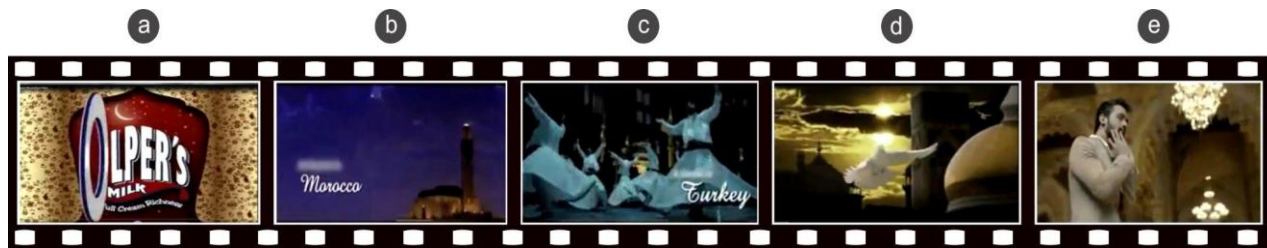
Figure 3 Olper's Hum Mustafawi Hain TVC : Religious signs and symbols are used abundantly in the ad. a. Olper's logo inside a mehrab; b. Morocco's Hassan mosque at night; c. whirling dervishes in Turkey; d. a white pigeon perching on a dome in the foreground while another dome is visible in the background; e. A model (Atif Aslam) praying in a mosque. The arches and fanoos of the mosque are visible.

below are some screenshots taken from the storyboard of the TVC: