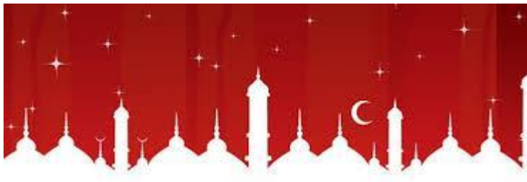
Figure 6: Islamic architecture as secondary or derived symbolism with primary celestial symbols.

In the image below, Lots of minarets and domes with crescents are shown. The sky is red with white stars and crescent (Olper's color pattern)