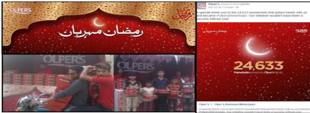
Figure 7: Ad showing a CSR campaign.