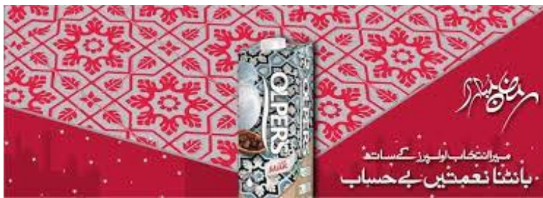
Figure 5: Geometric patterns and calligraphy in Olper's ad.

Olper's Ramadan print media ad, Note the design of the ad and the calligraphy. The design patterns follow the designs in mosques, shrines and prayer rugs. The Olper's package is also designed in the same pattern. During Ramadan, companies introduce special ramadan packages with special ramadan designs and logos.