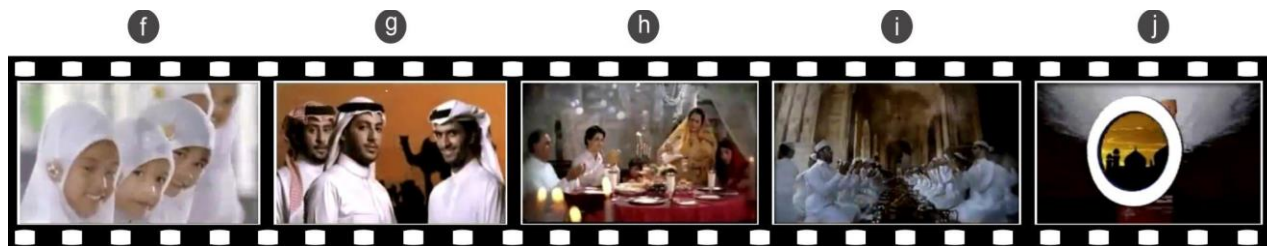
Figure 4 Olper's Hum Mustafawi Hain TVC: f. Girls in hijab g. Arab men in traditional Arab dress, a camel is also visible in the background. The background colour too is suggestive of deserts h. Pakistani family breaking fast and praying i. Men in the mosque breaking fast and praying j. Badshahi mosque inside Olper's O.